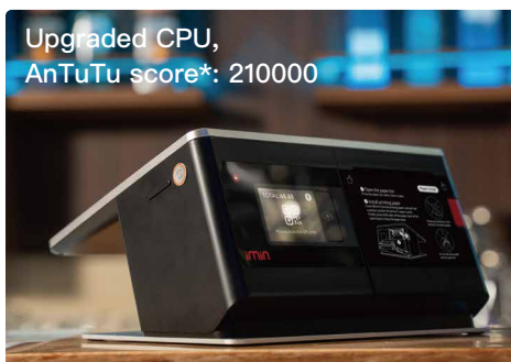
Upgraded CPU, AnTuTu score*: 210000