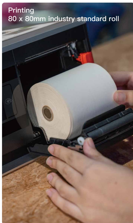
Printing 80 x 80mm industry standard roll