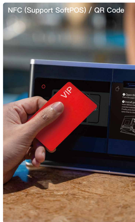
NFC (Support SoftPOS) / QR Code